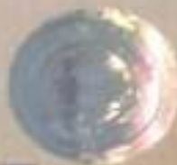
Chairman Rajasthan Public Service Commission, Ajmer